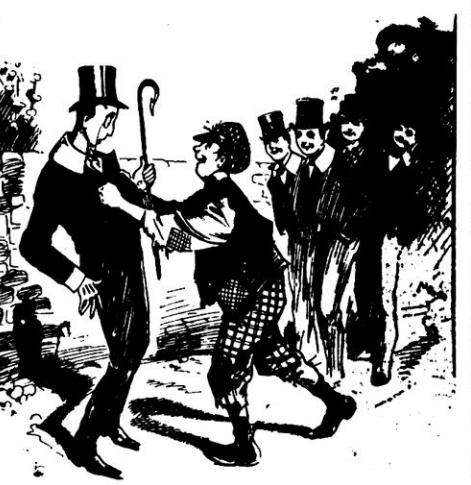
The ragged youth flung himself upon the neck of the horrifled swell St. Jim's. "Gh, Arty, Arty, 'ow glad I am to see yer again.

dug a grimy knuckle into his eyes. "Oh, Arty, how can yer? I never thought it of yer -I never did, really.